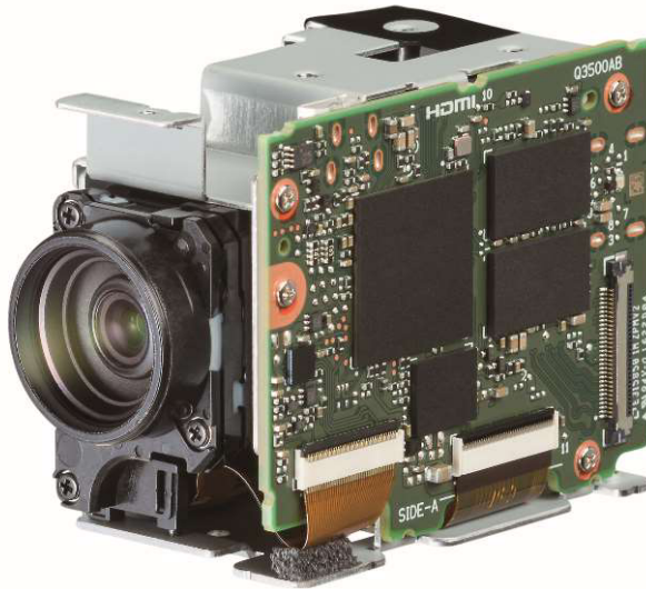
Ultra-Compact 10x Zoom